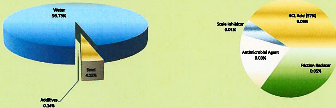
Composition of Hydraulic Fracture Fluid (by volume)