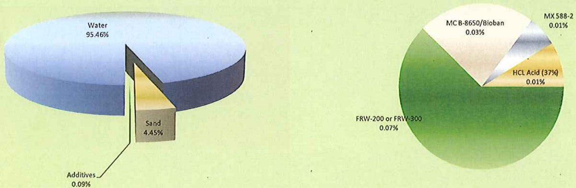
Composition of Hydraulic Fracture Fluid (by volume)